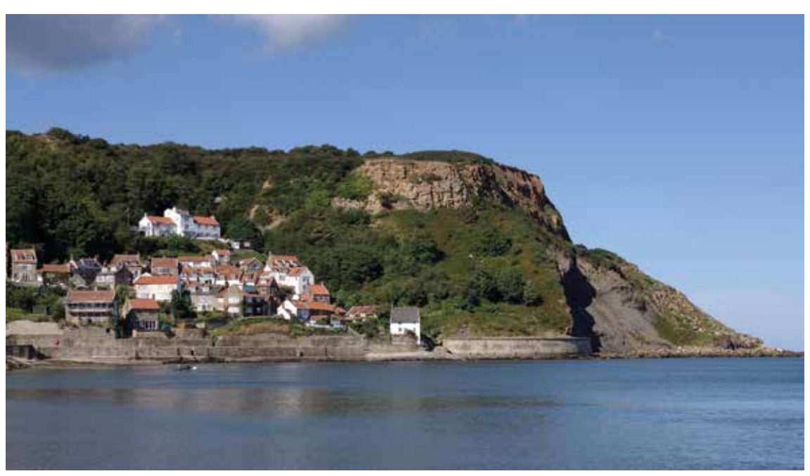
Figure 6: Local residents and businesses have contributed to funding Runswick Bay's coastal defences