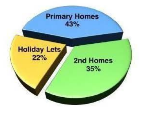
Figure 4.2: Use of dwellings in Southwold, 2015

4.25 In 2016, the SNP team conducted a comprehensive building by building survey of the town to obtain an up-to-date understanding of the number of buildings and their current use. This survey identified 1,388 number of houses classified as C3 use. Of these, it found that 57% of were occupied as second homes or were used for holiday letting. <sup>31</sup>