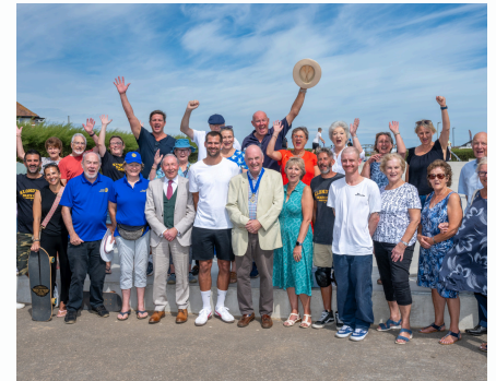
Stakeholders who helped fund.